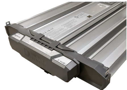
Battery backup on DLE fixture

Failure to meet any portion of the requirements can result in fines of up to $70,000 per violation and, in the event of an employee death, can reach up to $500,000 and/or imprisonment for an employer deemed responsible.